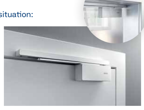
Extremely easy to install: the surface-mounted GEZE Active Stop for timber and glass doors.