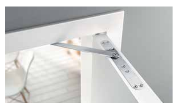
Conforms to the most demanding design requirements: the integrated GEZE Active Stop for timber doors.